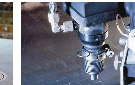
The optional high frequency punch marker permits accurate marking of points and lines.